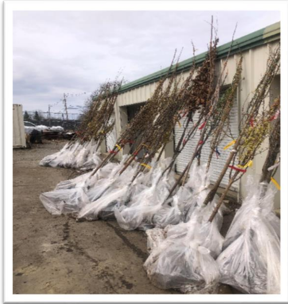
DELIVERED TREES TO PUBLIC WORKS STORAGE SHEDS

Delivered in only plastic bags and hydrogel, trees from Schichtel's Nursery of New York were handed off to Portsmouth's Tree Crew in April. These trees are the first of their kind to be planted by DPW staff.