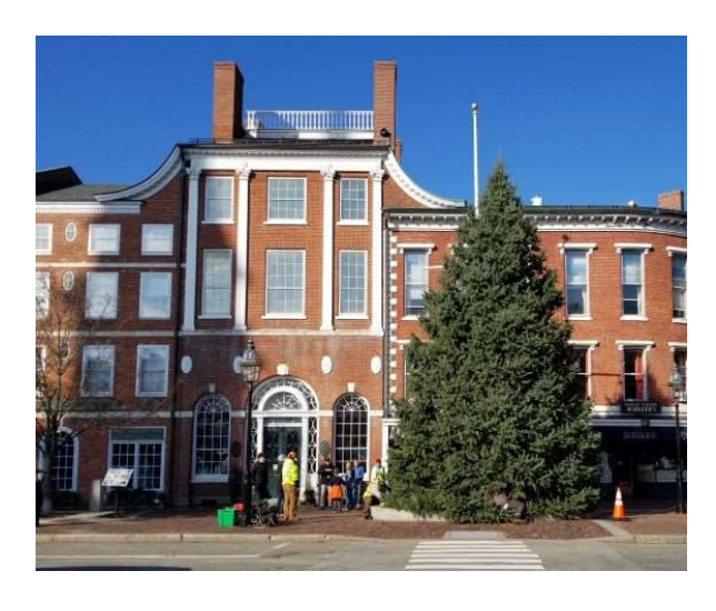
HOLIDAY TREE IN MARKET SQ. -- A 35foot blue spruce donated by the Fratamico Family in loving memory of Rose Zubkus.

HANOVER GARAGE: FLEET STREET ENTRANCE TEMPORARILY CLOSED STARTING MON NOV 28. Noise expected from concrete sawcut and demolition thru Dec 2. Work takes place between 8 am and 5 pm, Mon-Fri. Subscribe to the weekly emails and submit questions on the Hanover Garage Project page. Go to current work schedule: https://tinyurl.com/yc36x7ke