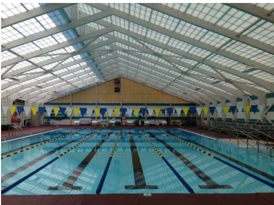
INDOOR POOL REOPENS WED OCT 5

HANOVER GARAGE PROJECT SCHEDULE – The contractor continues to install panels to reduce noise and dust. Noise expected from concrete sawcut and demolition thru Oct 14. Column demolition Oct 6 & 7. Work takes place between 8 am and 5 pm, Mon-Fri. Subscribe to the weekly emails and submit questions on the Hanover Garage Project page. https://tinyurl.com/5n85cuiv HANOVER GARAGE FAQs: Q. What is the work schedule for the project? A. Construction schedule updated weekly: https://tinyurl.com/uv9mcbs2