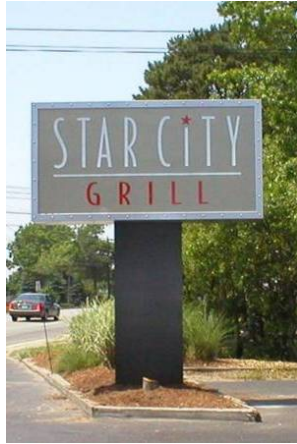
Width of support is approximately 1/3 of the width of the sign