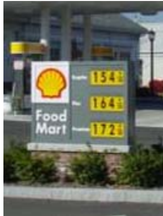
Height of base is less than one foot – Not included in sign area

10.1252.21 The base of a monument sign, up to one foot above the ground, shall not be included in the computation of sign area provided that such base is not illuminated in any way and contains no information other than the street number.