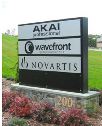
Height of base is one foot – Not included in sign area