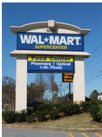
Total width of supports is less than 1/3 of the width of the sign – Not included in sign area

10.1252.22 The vertical supports of a pole sign shall not be included in the computation of sign area, provided that (1) the total width of all such supports is less than one-third of the width of the sign, and (2) the supports are not illuminated in any way.