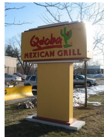
Width of support is greater than 1/3 of the width of the sign – Included in sign area