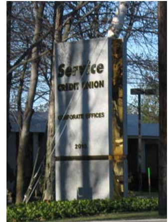
Height of base is greater than one foot – Included in sign area

10.1252.22 The vertical supports of a pole sign shall not be included in the computation of sign area, provided that (1) the total width of all such supports is less than one-third of the width of the sign, and (2) the supports are not illuminated in any way.