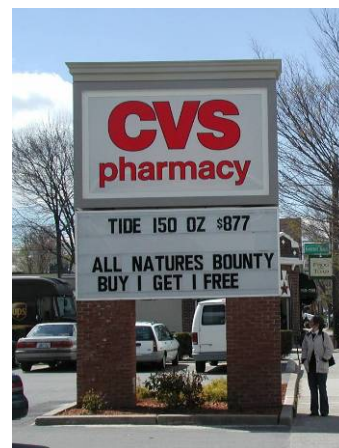
Total width of supports is greater than 1/3 of the width of the sign – Included in sign area