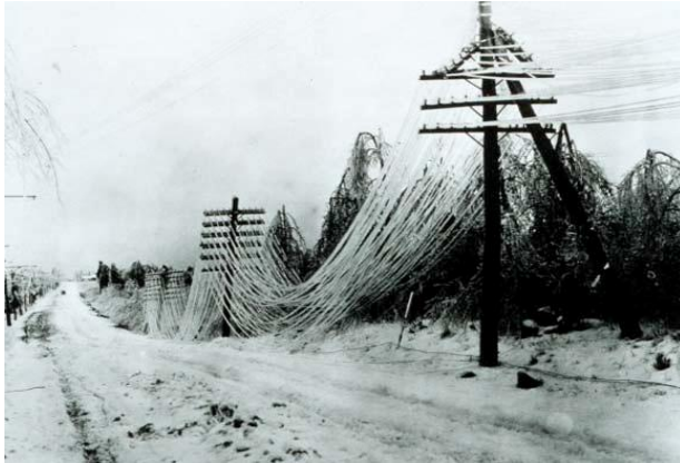
December 2008 Ice Storm